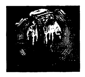
Figure 32. "Dressed for the King", stoneware by Nelfa Querubin

decayed past recognition. The study of pottery may allow inferences to be drawn about a culture's daily life, religion, social relationships, and the way the culture understood the universe.