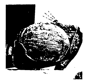
Figure 31. "Two Fishes", stoneware by Nelfa Querubin