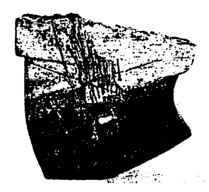
Figure 30. "Tranquility", stoneware by Nelfa Querubin