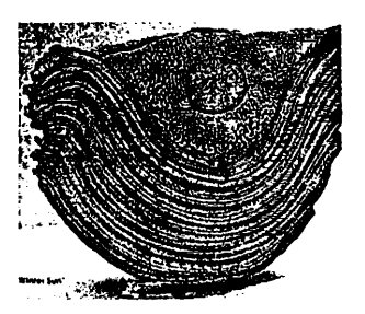
Figure 29. "Winter Sun", stoneware by Nelfa Querubin