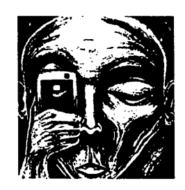
Figure 40. "Awareness", acrylic by PG Zoluaga