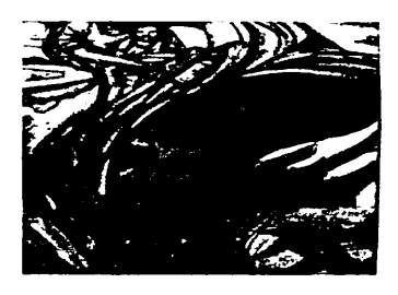
Figure 2. "Palas-anon sa Matag Adlaw", acrylic by Joe Amora