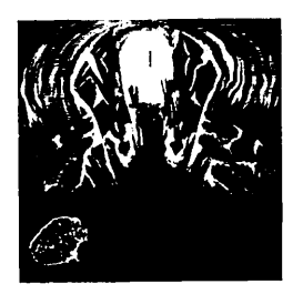
Figure 38. "Deliver Us from Extinction", by PG Zoluaga