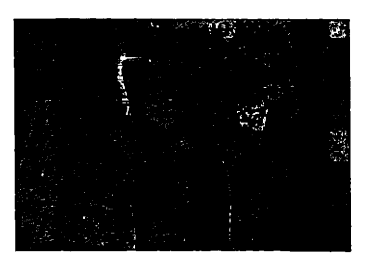
Figure 9. "Torso", terra cotta By Allan Cabalfin