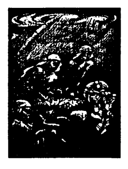
Figure 26. "Haw-as", acrylic by Fred Orig