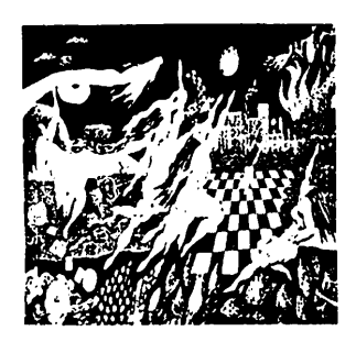
Figure 13. "Dancing for the Moon", acrylic by Ed Defensor