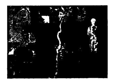
Figure 8. "Limitless Love", acrylic by Benjie Belgica