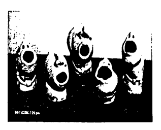
Figure 5. "Elan Vital Singing Figures 1", terra cotta by Benjie Belgica

Belgica is not only known for his terra cotta singing figures. In his paintings, he usually depicts women rendered with plants in the background and a touch of the ethnic style as seen in the addition of "patadyong" representation in the whole composition. "Patadyong" is a native cloth made by the weavers of Iloilo which is used for women's clothing. Like the "Limitless Love" (Figure 8) which presents two lovers, Belgica's paintings are unique in the sense that they are minimalist and at the same time, ethnic.