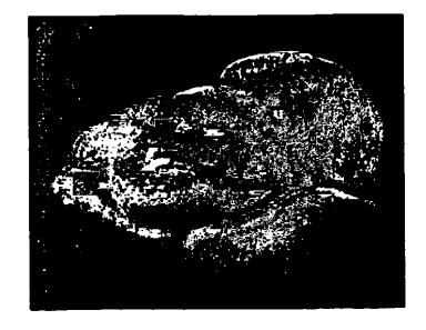
Figure 20. "Bust Series 1997", corral stone by Martin Genodepa