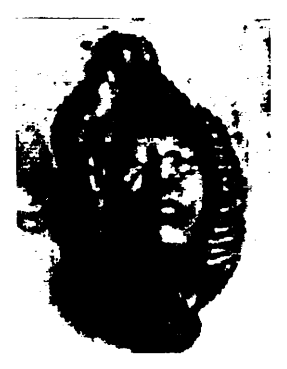
Figure 22. "Reaching Out", terra cotta by Harry Mark Gonzales