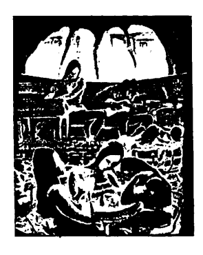
Figure 27. "Lunch Break", acrylic by Fred Orig

Orig's works reflect environmental and social aspects. Seen in his works are reflections of socialization in the urban setting as well as kakugi , a moral virtue of Ilonggos.