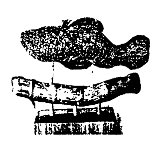
Figure 15. "Fillet o'Nails", nails and wood by Ed Defensor