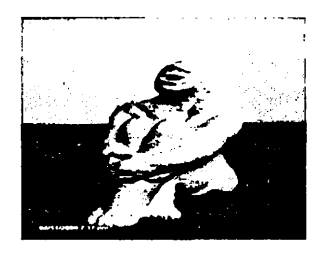
Figure 6. "Elan Vital Singing Figures 2", terra cotta by Benjie Belgica