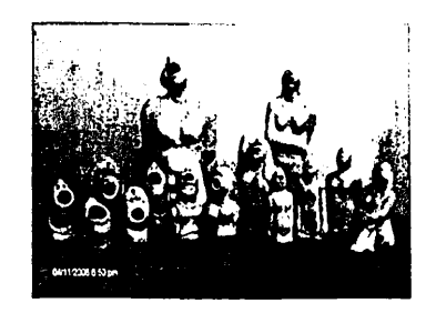
Figure 7. "Elan Vital Singing Figures 3", terra cotta by Benjie Belgica