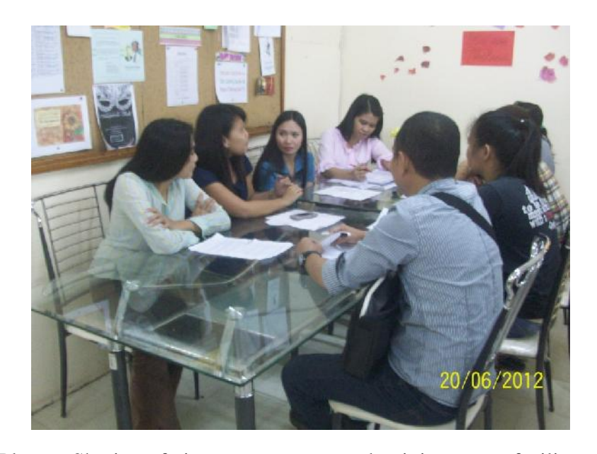
Plate 6. Sharing of views, comments, and opinions were facilitated