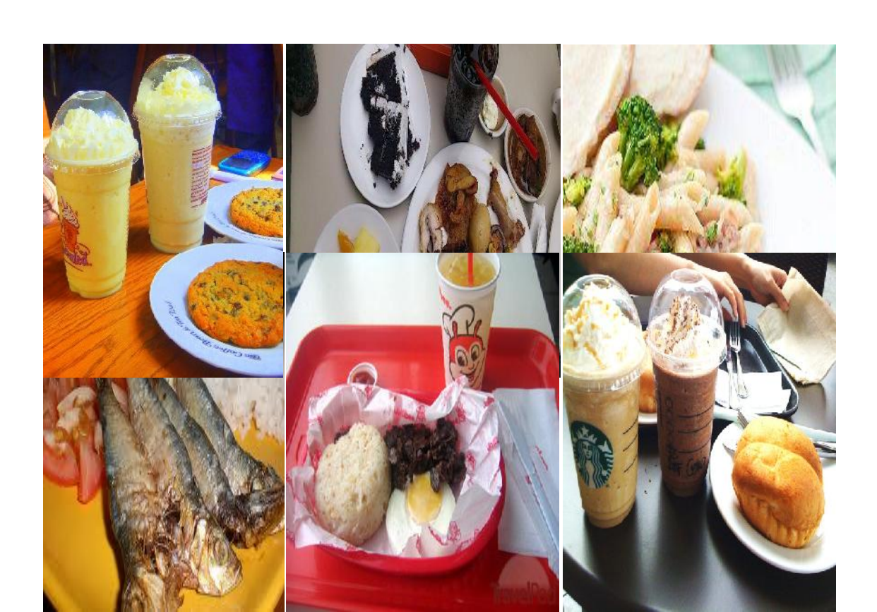
Food and the Desire for Food as Common Topics in Facebook

On the other hand, facebook users do not only resort to posting messages about food, but pictures, videos and links were also utilized in expressing their views about different experiences involving food. The illustrations below show some of the samples posted in facebook.