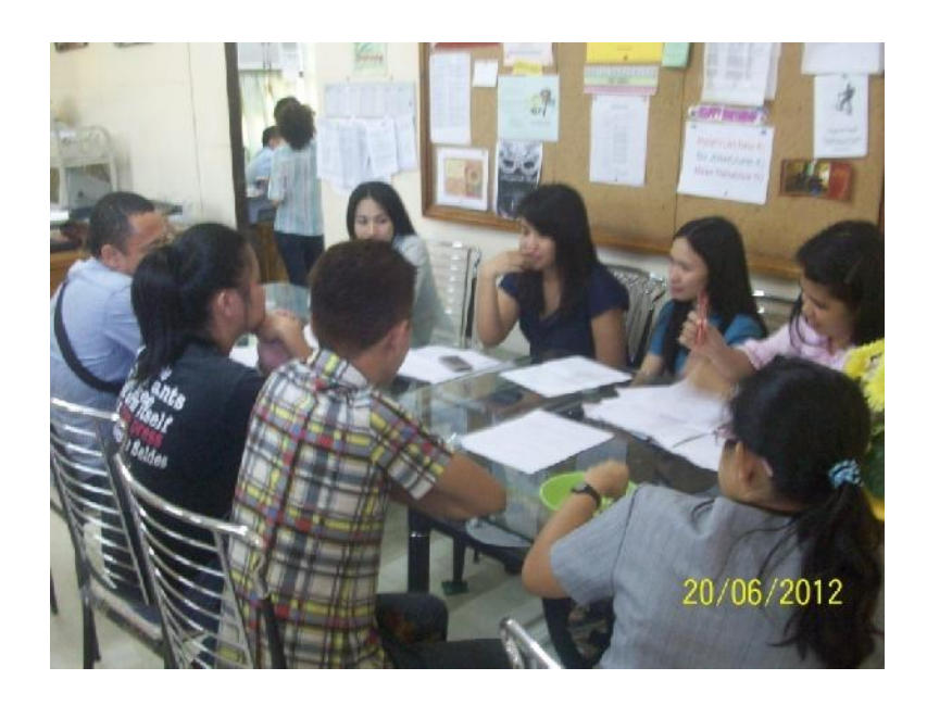
Plate 7. Finalization of ideas were generated and documented