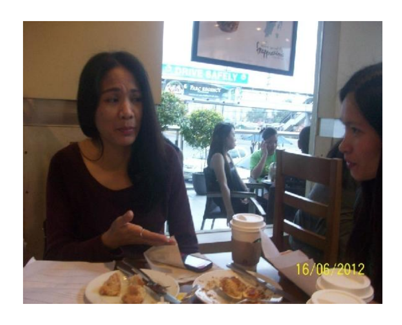
Plate 1. Initial meet up with FGD (focus group discussion)