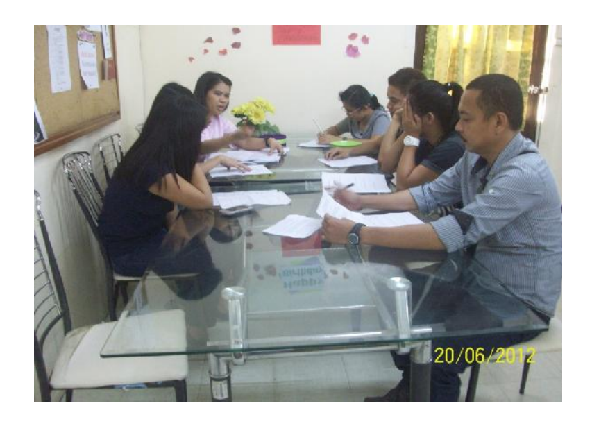
Plate 4. Clarification and Elaboration of ideas were observed