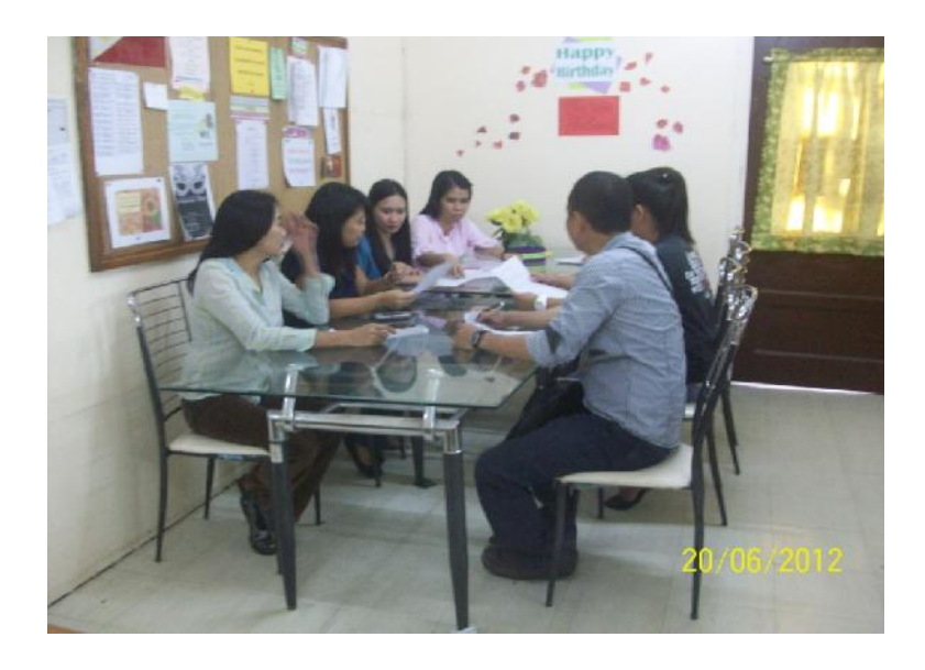
Plate 3. Focus group discussion (FGD) start of orientation