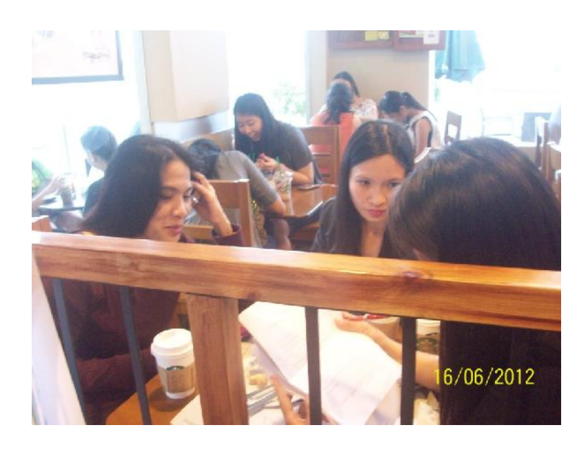
Plate 2. Brainstorming for responses based on the guide